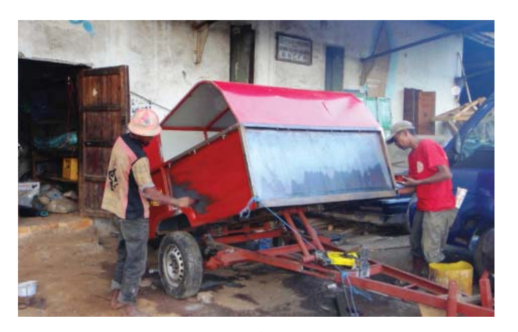
Tools and equipment needed for FSM, such as this trailer, are manufactured by local workshops using readily available materials.

Low cost, but still expensive: An August 2013 survey revealed that 72 percent of nonclient households were aware of the FSM service, though 58 percent indicated that it was too expensive. The service is currently unable to operate profitably at a price of less than US $31 per m<sup>3</sup>. Transportation is the largest driver of the cost, accounting for almost 30 percent of the tariff. The project