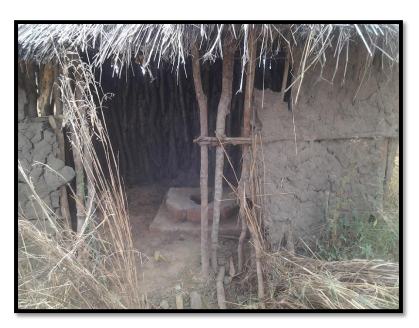
A school toilet before....