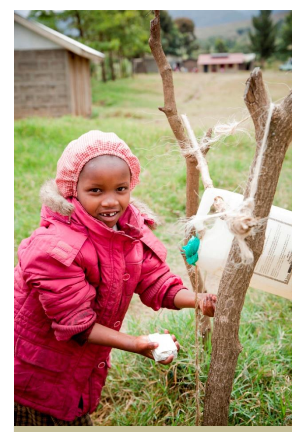
One WASHplus small doable action promoted to curb diarrhea was providing hand washing stations, like this tippy tap, near household latrines.

From January 2010 to September 2014 WASHplus worked with the Kenyan government to generate demand for sanitation; improve water, sanitation, and hygiene (WASH) practices among all households; and introduce simple supportive technologies to vulnerable households. The project supported the Ministry of Health (MOH) and its partners to integrate improved WASH practices into HIV policies, programs, and training. To do so WASHplus worked