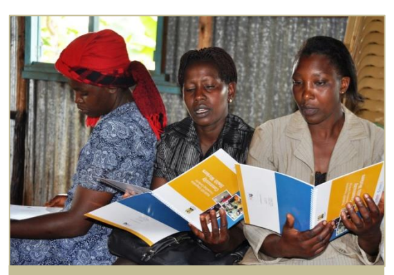
Community health workers use WASHplus materials during a training program on integrating WASH into HIV care and inclusive sanitation.

To test the small doable action approach, WASHplus piloted a complete integration of WASH-HIV activities in three subcounties representing agrarian, urban, and nomadic communities. Baseline data were collected in 3,286 interviews from intervention and control sites in 2013. Data collected provided some insights into the challenges of changing WASH practices in Kenya. Nomadic populations and to some extent rural areas still practice open defecation. Urban areas share latrines, which are considered by the UN's Joint Monitoring Programme to be unimproved. Most households do not have fixed hand washing stations, and only half of those with hand washing stations have soap and water present. Opportunities to improve water treatment practices also exist. Finally, semi-nomadic populations are the most in need and the hardest to reach.