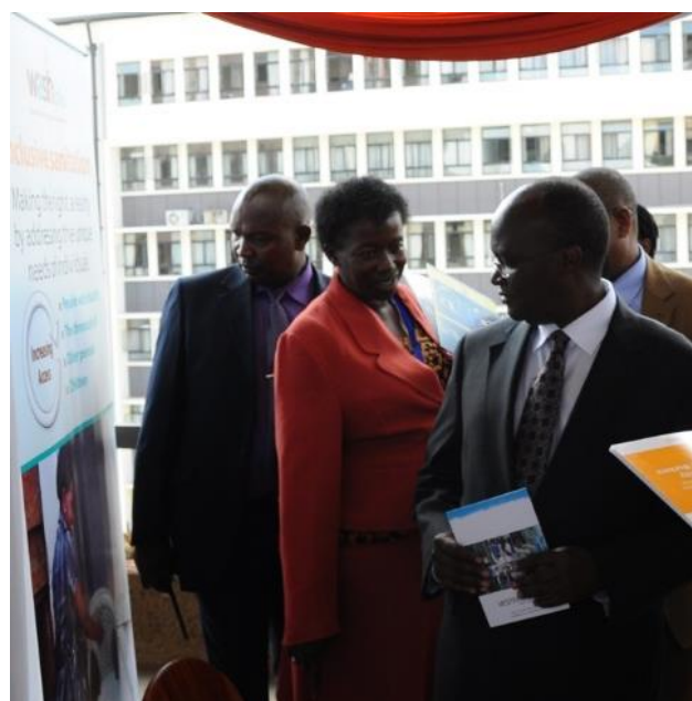
Cabinet Secretary James Macharia reads a banner on inclusive sanitation.